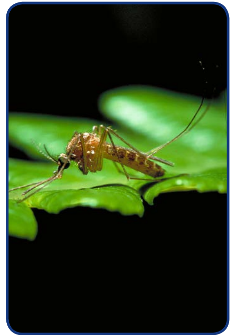
The Southern house mosquito, Culex quinquefasciatus , is a vector of avian malaria and avian pox