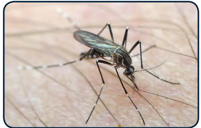
Mosquito species Aedes albopictus (L) and Aedes aegypti (R) can both transmit dengue, chikungunya, and Zika virus

The presence of mosquitoes in Hawai‘i represents a persistent and serious threat to public health, as well as to the economy and ecosystems. Diseases such as chikungunya, dengue, and yellow fever affect hundreds of millions of people worldwide, causing debilitating symptoms and sometimes death 3 . More recently, the Zika virus began to spread through the Americas, causing birth defects and neurological disorders 4 . These human diseases are transmitted by two mosquitoes, the yellow fever mosquito ( Aedes aegypti ) and the Asian tiger mosquito ( Aedes albopictus ), natives of Africa and Asia respectively. Both of these species have invaded Hawai‘i 1 and are responsible for sporad-