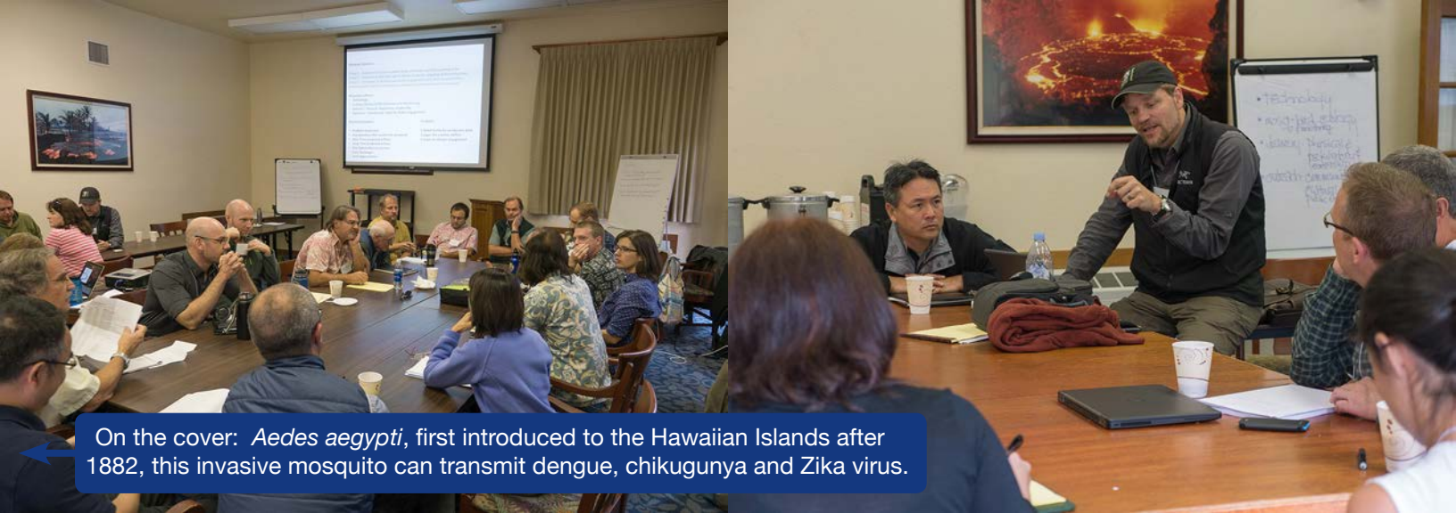
On the cover: Aedes aegypti , first introduced to the Hawaiian Islands after 1882, this invasive mosquito can transmit dengue, chikungunya and Zika virus.